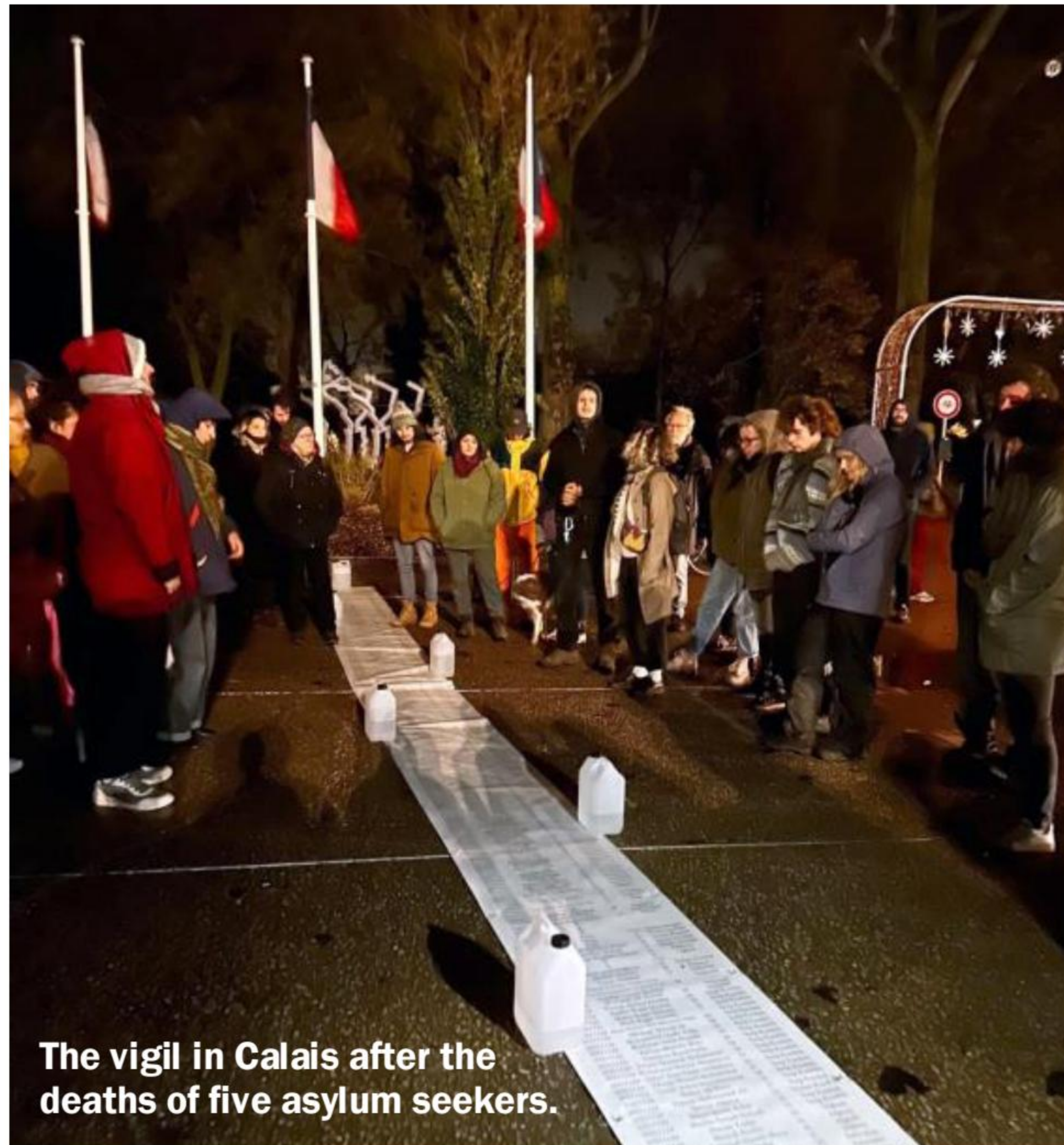
The vigil in Calais after the deaths of five asylum seekers.

“For me it’s all this, but it’s also the growing awareness of the violent forces behind this tragedy. It is impossible to say for certain how many people