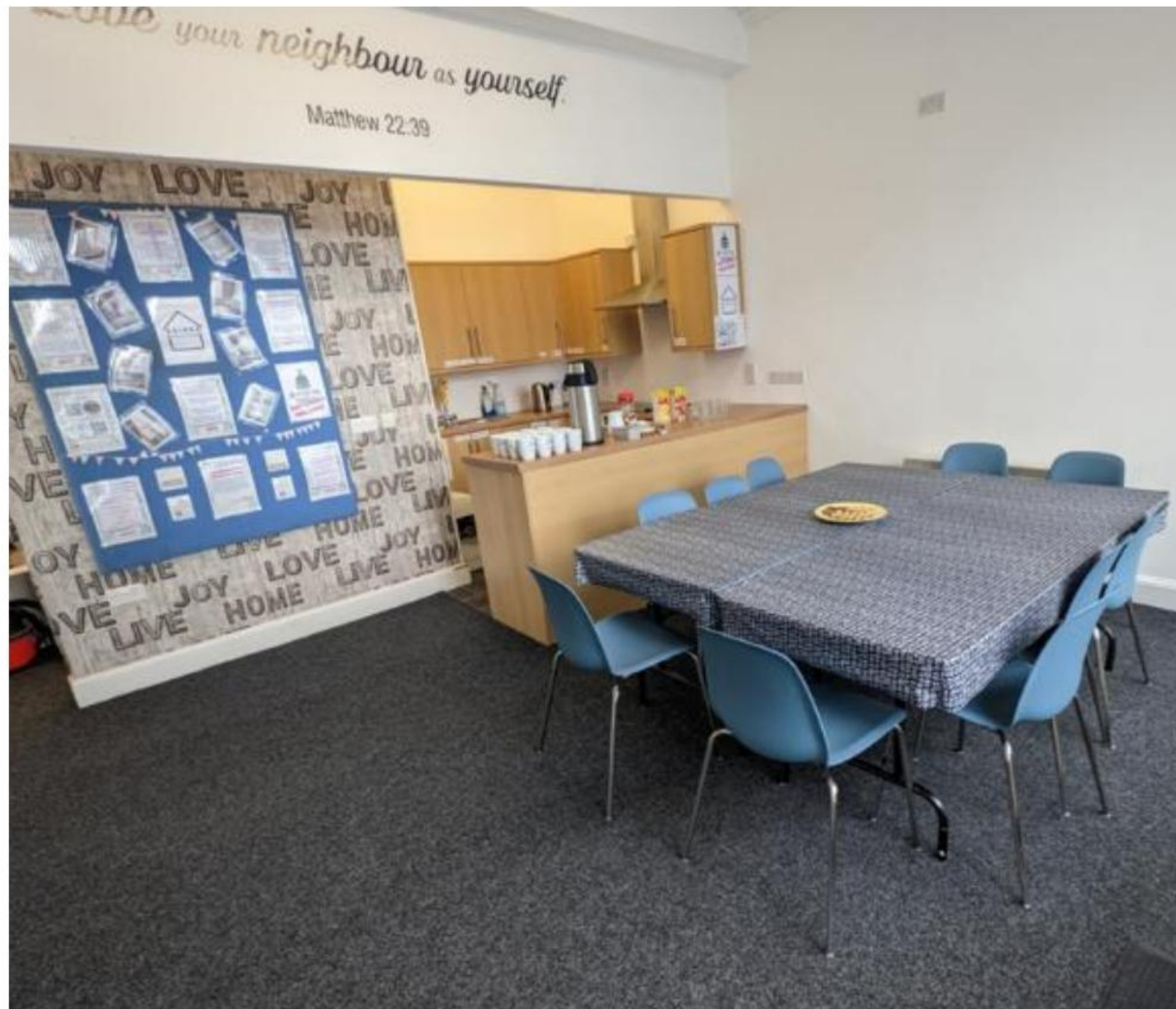
Residents say the Kairos Housing project based in Blackburn gives them the priceless gift of hope.

ject that residents talked about. They acknowledged the lack of available housing in the UK and were shocked that English people had problems finding homes in their own country.