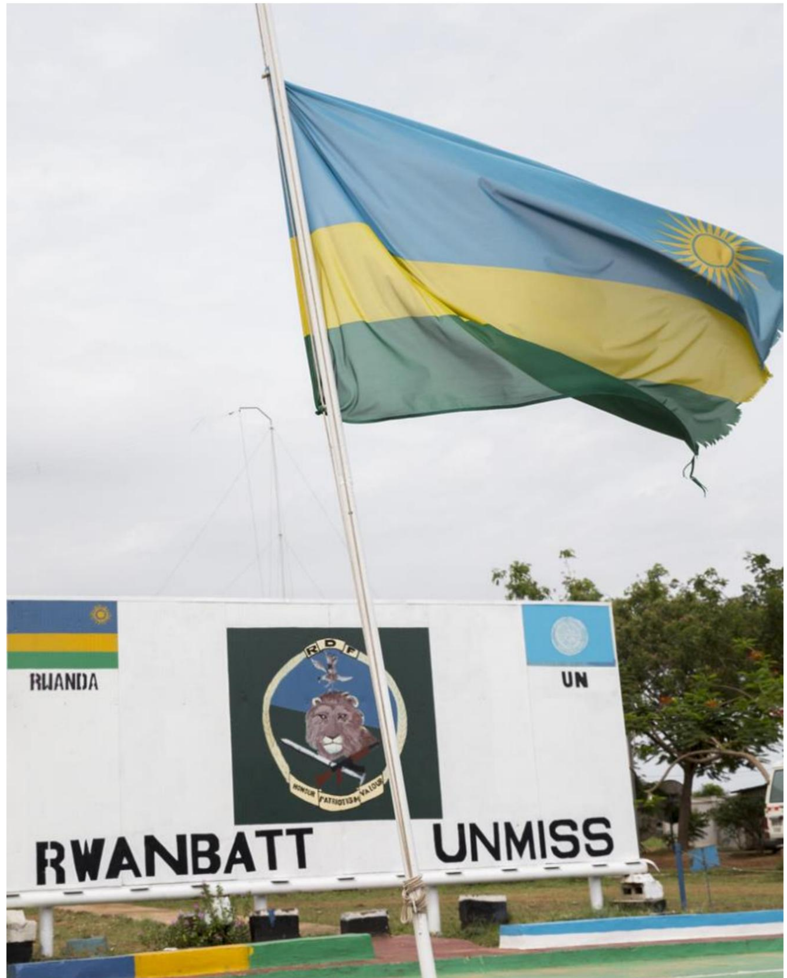
A commemoration of the anniversary of the Rwanda Genocide.

In 1995, The International Criminal Tribunal for Rwanda (ICTR), established by the United Nations Security Council, began to try its first cases of thousands of (mostly Hutu) prisoners who had committed acts of genocide in 1994. The tremendous number of people waiting to be tried led to a