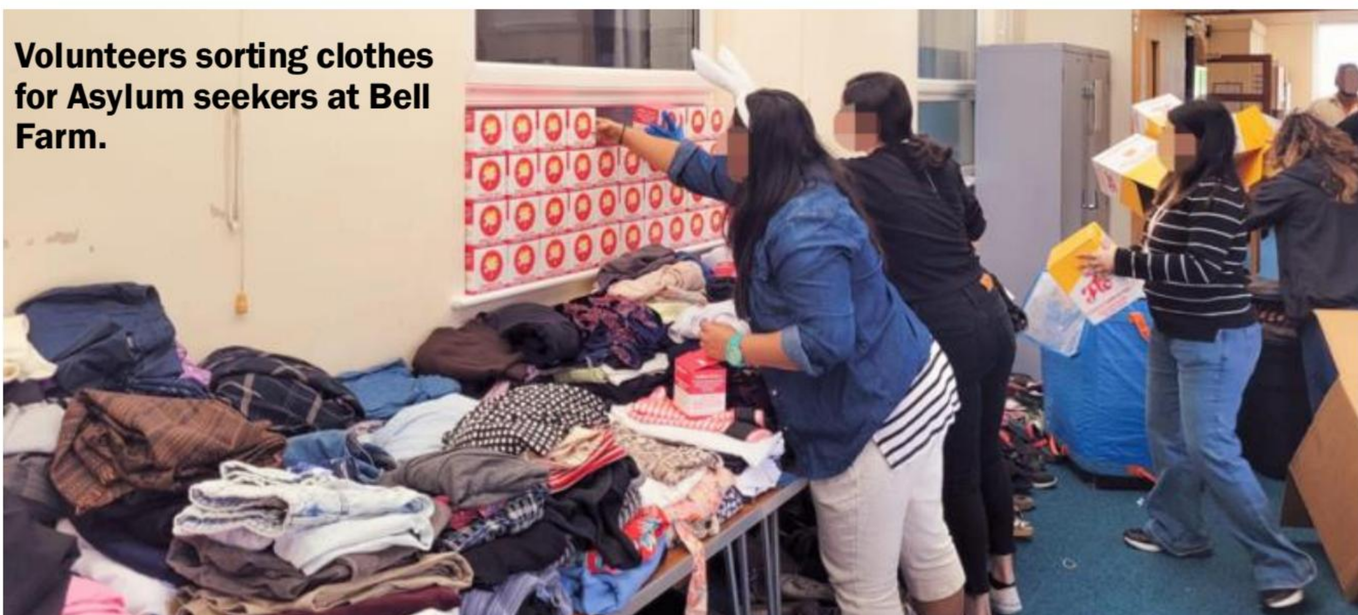
Volunteers sorting clothes for Asylum seekers at Bell Farm.