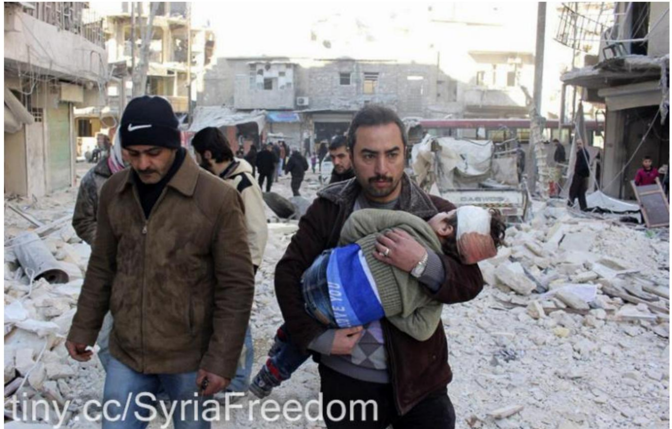
The aftermath of an attack on Aleppo, Syria.