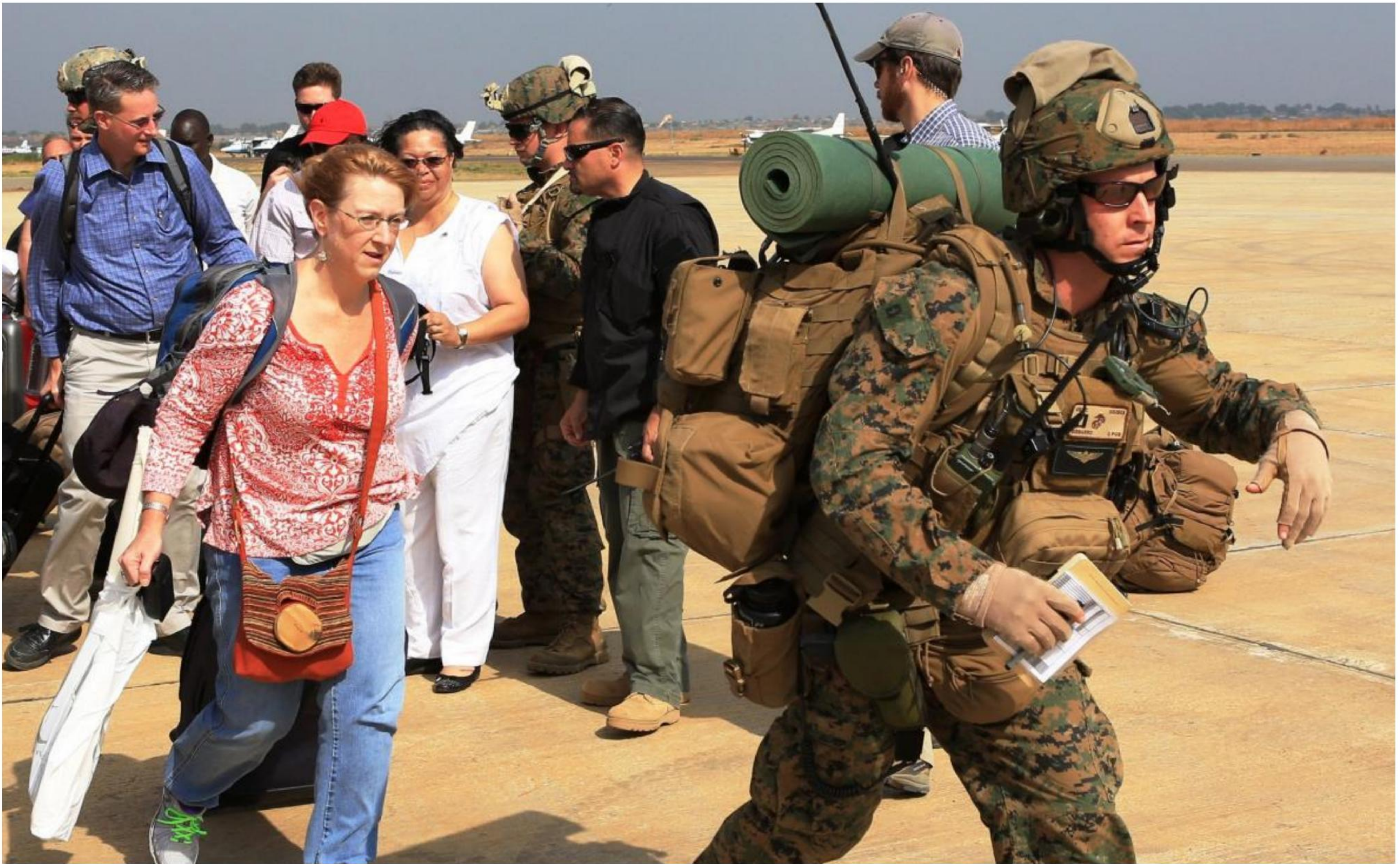
Marines evacuate embassy staff in Sudan after the outbreak of the civil war. Refugees fleeing the violence face a far more uncertain journey in search of sanctuary.