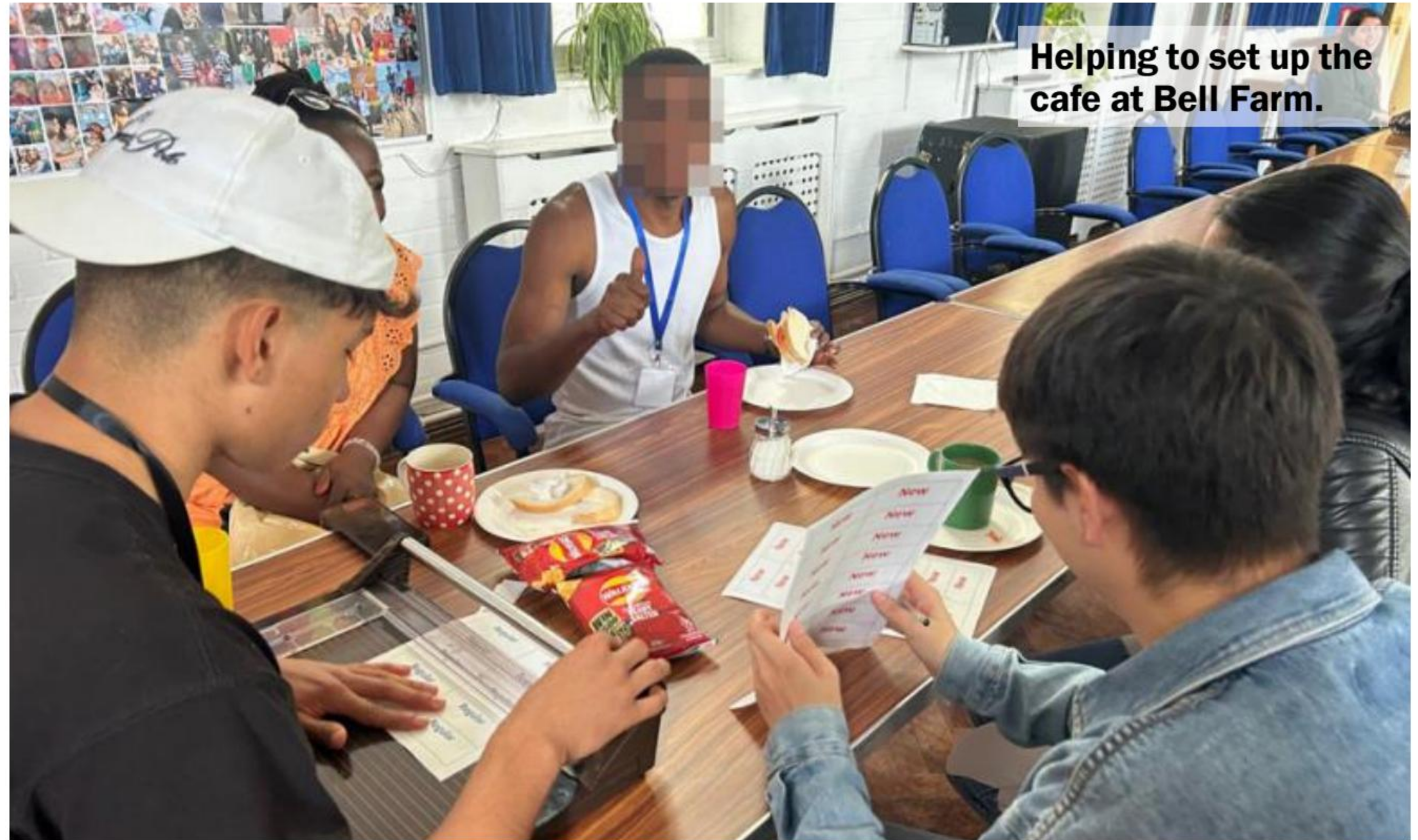
Helping to set up the cafe at Bell Farm.

The men's clothing was neatly organised for easy selection, while the women's, children's, and teens' items were stored