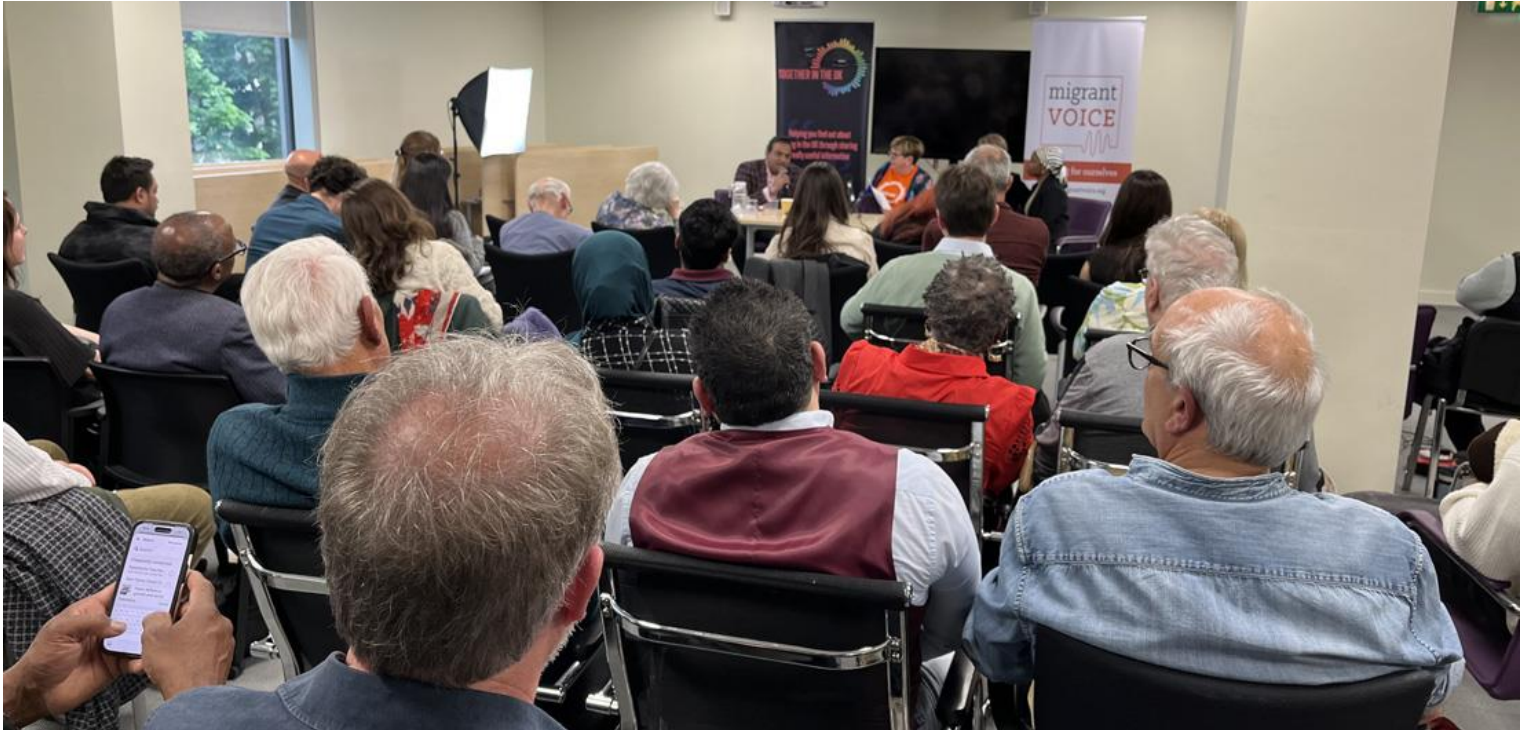
The audience at the Migrant Voice and Together in the UK event heard three migrant authors talk about their experiences.