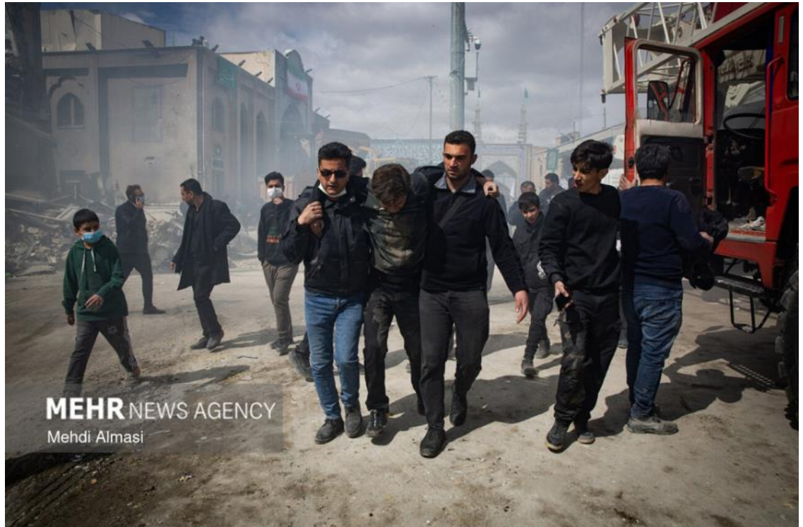
The war has so far seen an estimated 3.2 million people displaced inside Iran.

Amnesty and other human rights groups have said the use of the death penalty in Iran has increased following widespread anti-government protests in January and the outbreak of war with Israel and the United States on February 28.