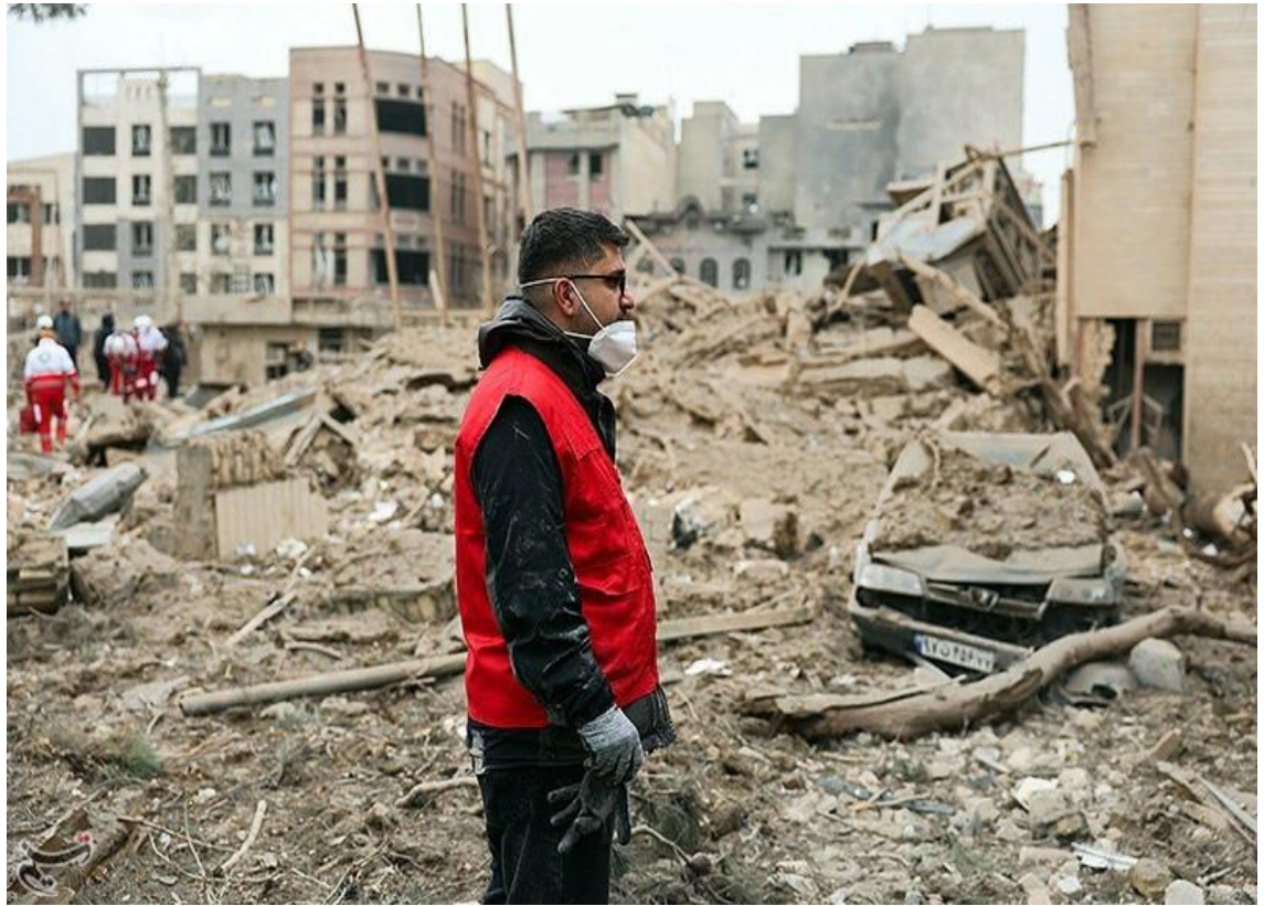
A rescue worker surveys the damage on Shohada Square in Tehran in the aftermath of an air attack in March.

At present, the number of registered Iranian asylum applications in the EU and neighbouring countries remains relatively low. In 2025, approximately 8,000 Iranian nationals applied for asylum in the EU —