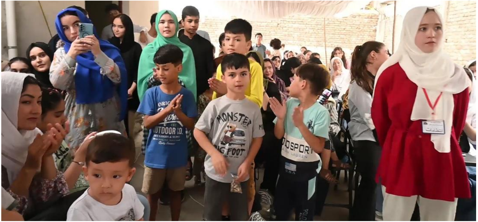
A group of Afghan refugee school pupils in Pakistan.